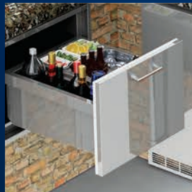
Undercounter Ice Bin