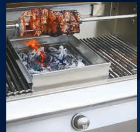
Solid Fuel Insert

SPEND RECEIVE* $6,000 $300 REBATE $9,000 $500 REBATE